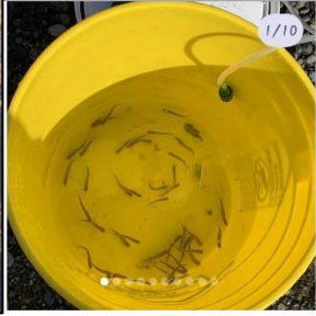
(Two different elementary schools releasing their classroom raised salmon into the river and headed for the big blue)

WDFW/WA PARKS AND RECREATION COMMISSION AND DNR RELEASE: Announced was the closure of all state campgrounds across Washington to help reduce the spread of COVID-19. Campgrounds will remain closed through April 30. The closure includes roofed accommodations like cabins and yurts. Although camping is not allowed, WDFW wildlife areas and water access areas remain open for public use at this time. However, due to theft and increased usage of their restrooms,