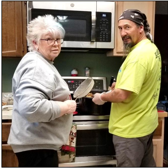
(What do you mean we have to postpone NOW! ARE YOU KIDDING?)