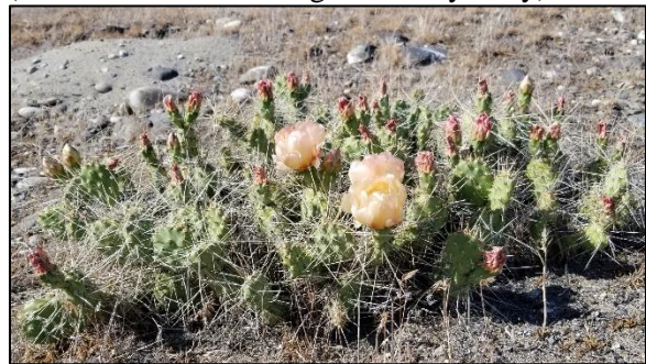
(Brittle Prickly Pear in Benton County)