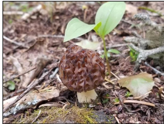
(Morel Mushroom being shaded by a lily)