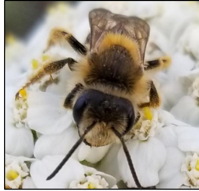
(Mason Bee on Common Yarrow)

FAUNA AND FLORA SURVEYS: For the spring and summer seasons there will be wonderful opportunities to get outside and get to know your native species that live right under your nose. I challenge each member to go out and find 5 native species of insect, animal or plant each week. See how many you can identify and send your pics to the secretary! Bumblebee surveys are starting, so don't mind the blonde one- running around taking pictures of bugs on flowers.