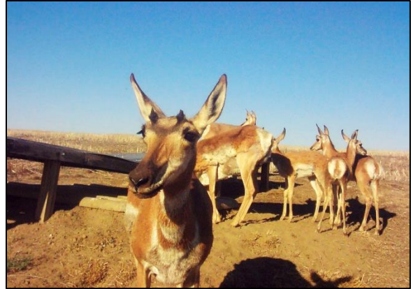
(Pronghorn Antelope babes at guzzler)