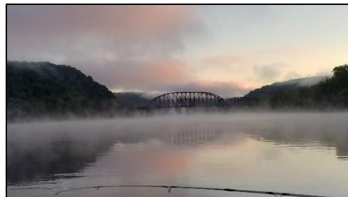
(Fishing in the morning evanescence in PA)