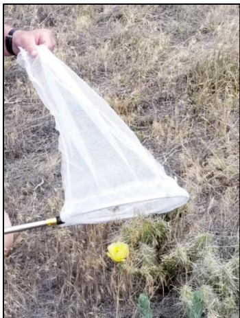
(Someone caught the rare Opuntia Columbiana in bloom!)