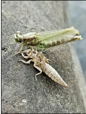
(Western Pondhawk with its' exuvia)