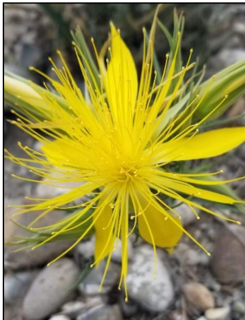
(Blazing Star)