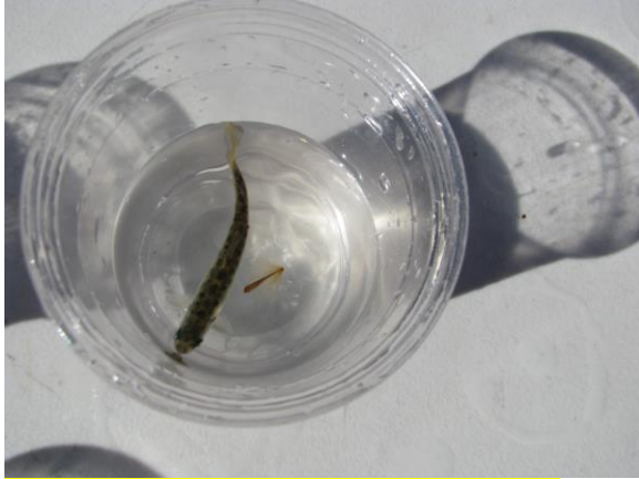
This is what it is all about, salmon smolt