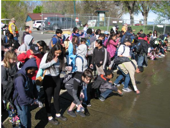
Tuesday's smolt release. They grew them and now they are turning them loose.

BULLETIN HELP – EMAIL vs. USPS: If you are receiving this bulletin via U.S. Mail and you have an email account, please send an e-mail to rrgcsecretary@gmail.com . You will get quicker delivery and save us money.