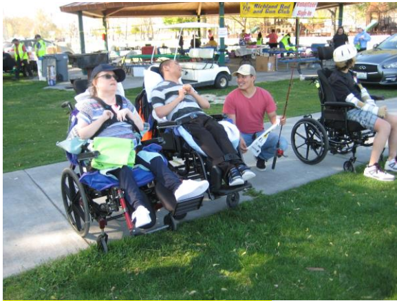
Friday Evening Fishing Clientele

261, 184 tagged trout were caught and prizes were awarded.