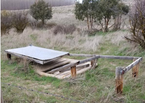
An Extreme Before Photo of a Guzzler 184

shrubs and trees were planted 25 to 30 years ago.