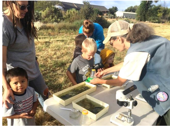
(Duck Days pond life under the microscopes)

There were several stations such as hunter safety, Retriever Demonstration, Ducks Unlimited Conservation, Duck Calling, Pond Life, Nest Box Building, Taxidermy, Identification, Decoy Wood Carving, Coloring and everyone's favorite- Duck Banding. Several McNary Biologists/Staff/and Friends of McNary Volunteers were in attendance as well as a couple Hunter Ed Instructors, Ducks Unlimited members and quite a few RRGc members. The kids went to each station learning a plethora of new things about the outdoors and when they were finished at each station, they received a stamp on their passports. Once the passport was complete, they got a prize this year it was either a kid's token for a meal at Texas Roadhouse or a Dairy Queen card good for a free ice cream cone (yum). All in all, there were 3 nest boxes built, 8 ducks banded and a bunch of happy kids to be outside doing the real-life hands-on stuff. I was pleasantly surprised to see how many kids came out just to say they wanted to work at McNary when they grew up! Lets all take head and remind the next generation that there is a "McNary" in everyone's backyard. And to get out and go investigate, ask questions and become the conservationists of tomorrow.