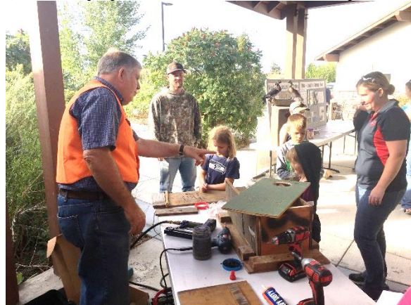
(Wood Duck nesting box building)