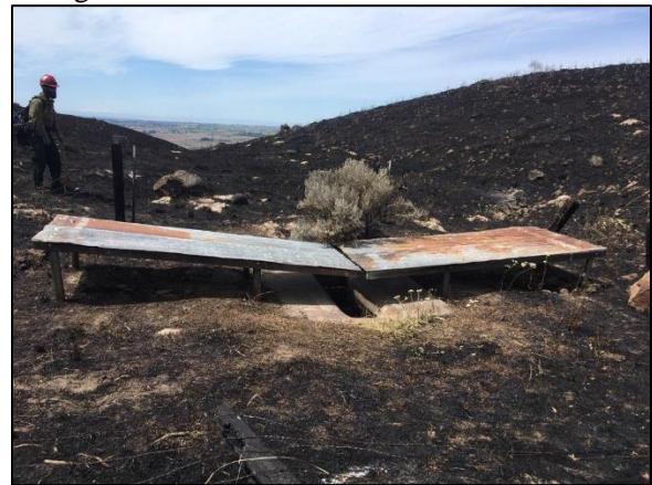
(Guzzler photo taken by Firefighters)