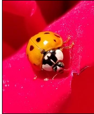
(Lady Beetle on a Rose)