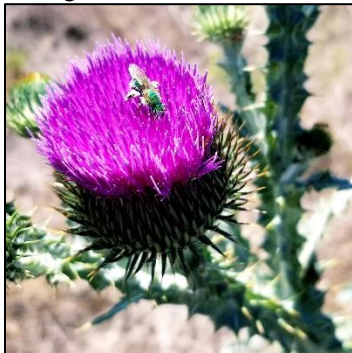
(Sweat Bee on Thistle)

FAUNA AND FLORA SURVEYS: For the spring and summer seasons there will be wonderful opportunities to get outside and get to know your native species that live right under your nose. I challenge each member to go out and find 5 native species of insect, animal or plant each week. See how many you can identify and send your pics to the secretary! Bumblebee surveys are starting, so don't mind the blonde one- running around taking pictures of bugs on flowers.