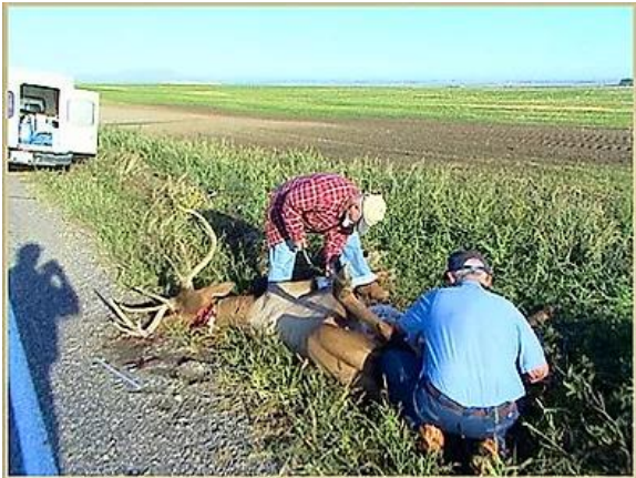
(The very first Recovery in 2008)