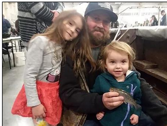
(Lots of happy fishers)

like numbers: We had 107 volunteers/ 90 from the club w/friends and 17 from the Chiawana High School Fishing Club. Because of working multiple shifts, we had 174 volunteers that worked the nine shifts including setup and teardown. The total number of hours worked were 573! Of the fish caught; there were 189 on Friday, 572 on Saturday and 772 on Sunday for a total of 1,533 fish caught of the 2,000 we stocked. 200 fish were tagged for prizes and of them: 12 were caught on Friday, 28 Saturday and 58 Sunday for a total of 98 prizes rewarded to the Next Generation of Fisher People of the Mid-Columbia. Check the website for all the amazing pics and if you have any to add please send them to the webmasters.